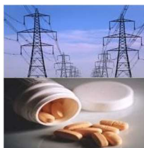
Power & Equipment